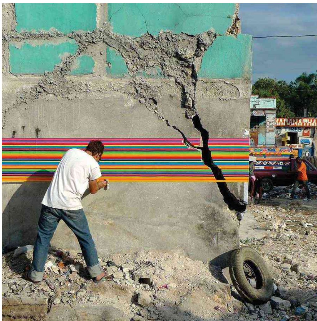
The Ghetto Biennale: This December, more than 30 foreign artists arrived for a week of work and conversation with their Haitian counterparts.

Downtown there is the Ghetto Biennale on Grand Rue , where foreign artists come and meet Haitian artists and work for a week. (Despite the current unrest, more than 30 foreign artists turned up for this great tradition, which begins in mid-December.) There's the annual jazz festival, during which musicians play all over town. There's Grande Plaine, the tiny peasant community outside the town of Gros Morne that has reforested its area with the help of family members living abroad. There's the park in Martissant that neighbors—including gang members—cultivate and use for recreation and craft markets. Little shoots of possibility everywhere.