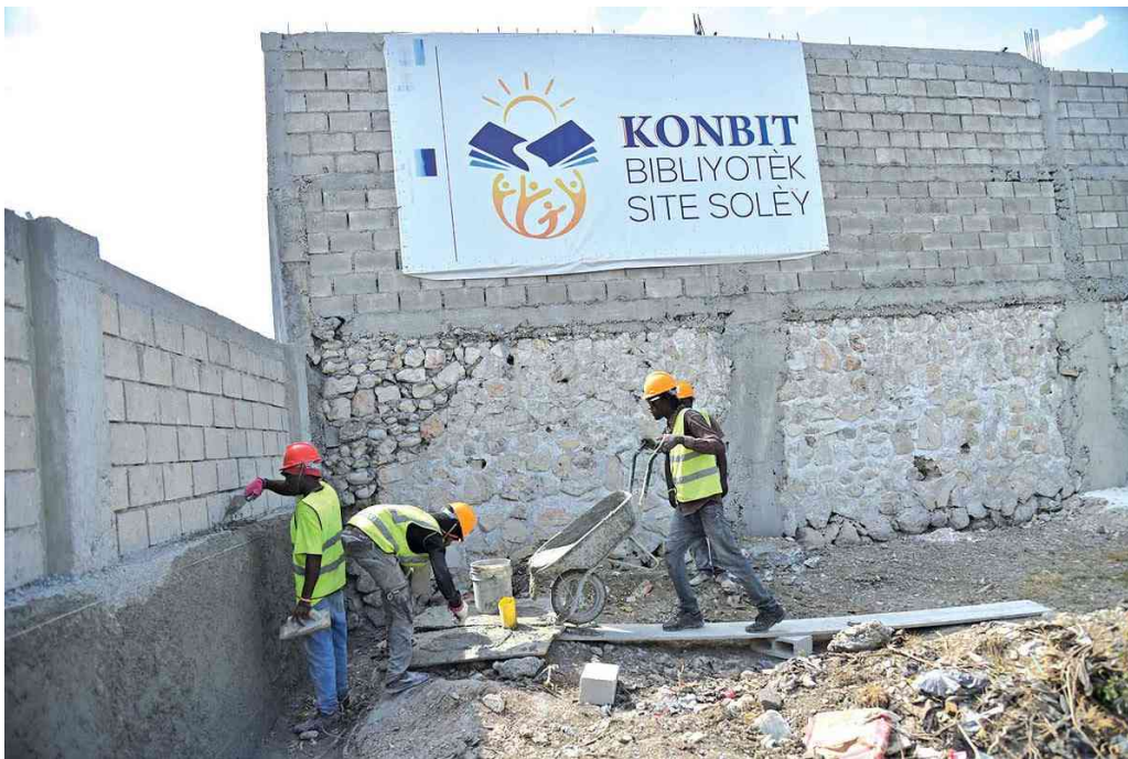
Book by book: In Cité Soleil, where armed gangs roam the streets, a library is being built by the community.