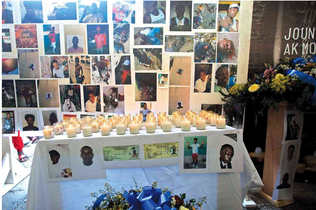
Not forgotten: An altar commemorating the victims of La Saline massacre.

It turned out the Reagan administration had other ideas about who could run Haiti. The State Department put together a clique of Haitian political figures and army officers known officially as the National Council of Government but called by Haitians what it was: the junta. The Trump administration, au contraire, apparently can’t imagine an alternative to its pliant Haitian banana dealer.