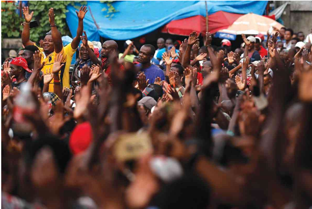
A country in lockdown: During the months of peyilok , different sectors of society each marched. Here, artists from Port-au-Prince take to the streets.

attracted recently have been the opposition factions that met to produce what are known as the Marriott Accord, which seeks the replacement of the entire Moïse government, and the Kinam Agreement (at the Hotel Kinam), which calls for the replacement of the entire government—except for Moïse.