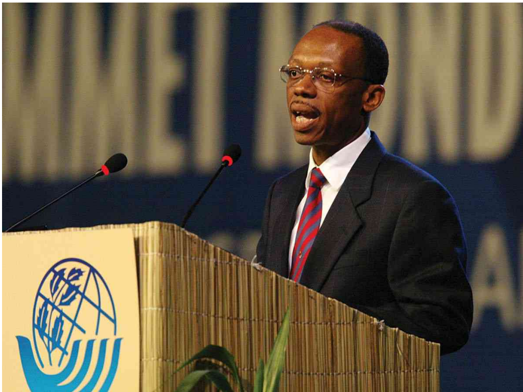
Yesterday's man? Jean-Bertrand Aristide was elected president in a 1990 landslide that none of his successors have matched—which didn't protect him from a US-sponsored coup.

Most Haitians simply don't believe in elections as they are currently run. To quote the former president Jean-Bertrand Aristide, who was elected in a 1990 landslide that no one has yet questioned (or duplicated), elections in Haiti have since turned into “selections.” Aristide, by the way, was ousted in a coup green-lit by George H.W. Bush's administration just nine months after that landslide . So much for the legitimately elected.