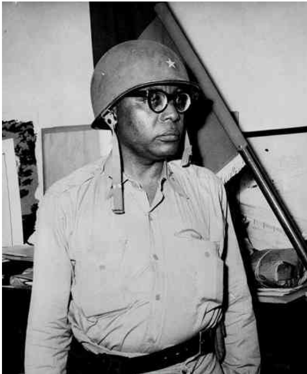
Papa Doc at war: President for Life François Duvalier fighting off a military coup in 1958. He led his despotic regime for 13 more years, until his death.

He greets me in his very presidential office: huge desk in the center, white walls, white tile floors, bookshelves, the Haitian flag. He is wearing a formal white guayabera and pressed pants and doesn't seem substantially changed from the person I first met back in 1986, when Jean-Claude Duvalier (aka Baby Doc, the son of François "Papa Doc" Duvalier, the country's notorious longtime strongman) had just fallen. Back then, Aristide was a firebrand priest from the poorest parish in town. His break with the church, his two presidencies (or three, depending on how you count them), the two coups d'état against him, his two forced exiles, marriage, fatherhood, projects of all kinds—nothing seems to have changed him. He remains the kind of person who would love a peyilok movement. No doubt he'd like to lead it.