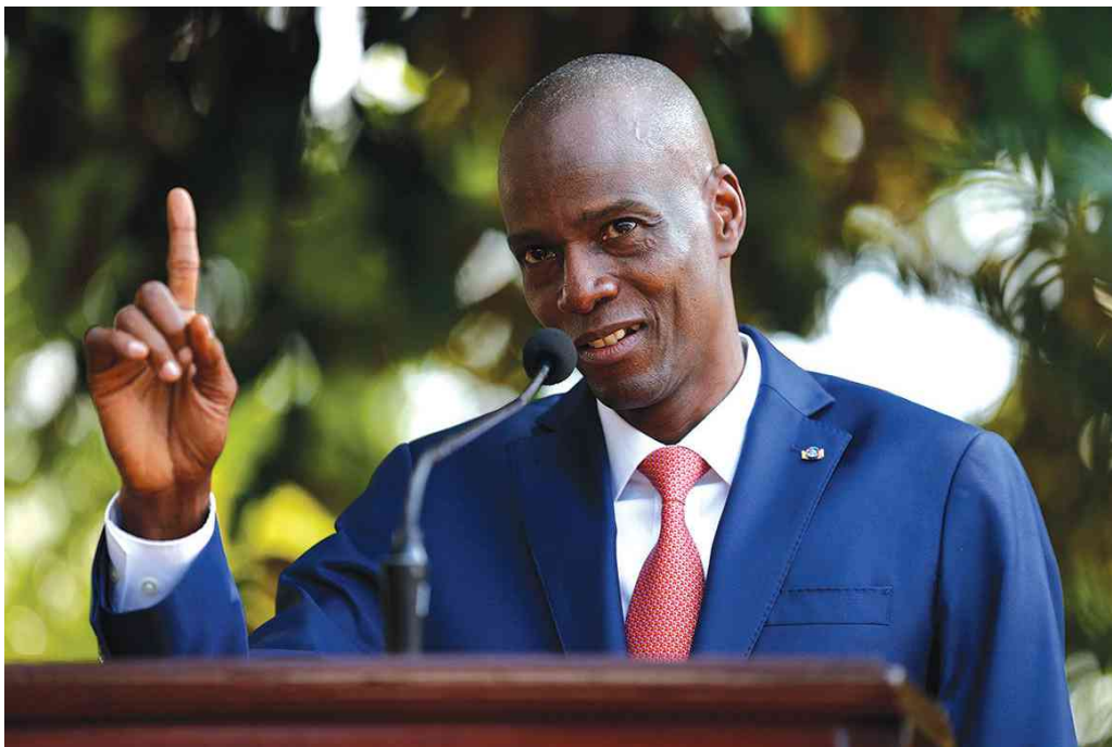
Not going: Haitian President Jovenel Moïse has defied repeated calls to resign—warning that there will be “accidents” if people get in his way.

A fter the visits, Moïse reached out to the opposition, as recommended by his American friends, always with the understanding that he was not going to leave. The opposition initially refused his invitation . That’s when I arrived, expecting peyilok , armed gangs, paralysis. I took an armored car to my hotel with two big bodyguards in the front seat. In spite of all the dire warnings, everything was calm. Feeling ridiculous—even foolish—and extremely white, I quickly abandoned the security detail. From then on, my stay was in many ways like every other time I’ve spent in Haiti. Although we drove high up into the hills above town and then far downtown into the poorest and most crowded areas and then over to the shantytown where I’d been told I absolutely could not go, we had no problem.